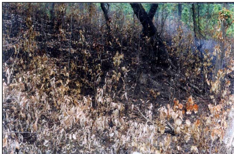
Figure 4: Forest fire in Hariyali CFUG, Kailali

People with a complaint against the forest officials sometimes start fire maliciously. Such a situation is created, as people are dissatisfied with the way of forest department staff's use of power to control resources. Another causes of forest fire are the conflicts that arise with perverse policy (e.g. community forests' revenue sharing mechanism, collaborative forest management, delaying handover the forest to community, lack of tenure security, ownership and incentives) and external forces (e.g. demographic changes, high migration) (Figure 4).